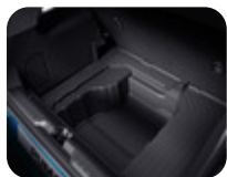
MegaBox Boot Liner Black with raised edges – Diesel vehicles without spare wheel