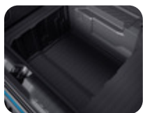
MegaBox Boot Liner Black with raised edges – Petrol vehicles without spare wheel