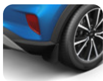
Mud Flaps rear, contoured Set of 2 – Titanium and Titanium X