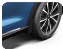
Mud Flaps front, contoured Set of 2 – Titanium and Titanium X