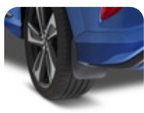
Mud Flaps rear, contoured Set of 2 – ST-Line and ST-Line X