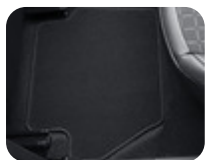
Carpet Floor Mats rear, black Contoured, set of 2