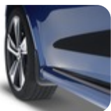
Mud Flaps front, contoured Set of 2 – ST-Line and ST-Line X