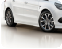
Alloy Wheel 18" 5-spoke Y design, Rockmetallic machined Single alloy wheel, 7.5j x 18", offset 55, fit with 235/50 R18 tyre