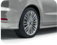
Alloy Wheel 19" 10 x 2-spoke design, luster nickel Single alloy wheel, 8j x 19", offset 55, for tyres 245/45 R19