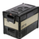
ARB* Zero Electric Coolbox 44L

Portable single zone electric coolbox with a front top opening lid, it can be used as a fridge or freezer and is the perfect size for a couple or a small family to take on camping trips. Easy to carry with recessed handles. Features handy front and rear DC inlets for use inside your vehicle and a front AC inlet for at home or on a powered campsite. A touch pad control panel lets you control, set and boost temperature. A free downloadable app from Google Play or Apple app store also lets you monitor and control your coolbox wirelessly with your bluetooth enabled device. Can be used in combination with the ARB tie down kit and the ARB cargo track and load ring kit (available separately)