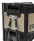
ARB* Tie Down Kit for Zero electric coolbox

The tie-down kit is specifically designed for the Zero electric coolbox. it ensures safe and secure tie-down and prevents movement during transit. Twin hooks attach to the coolbox and adjustable webbing straps are used to apply tension.