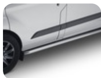
ARP* Side Protection Bar polished stainless steel tubular design

Set of 2 tubular side protection bars. Electro-deposit primer (EDP) coating black for corrosion prevention. Installation requires no drilling. Length: 2450 mm, diameter: 60 mm by 1.5 mm of wall thickness. Made from ST304 stainless steel and mounting brackets made from ST052 steel. – Vehicles with long wheel base. Except Sport Van