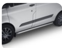
ARP* Side Protection Bar polished stainless steel tubular design with corner bends

Set of 2 tubular side protection bars. Electro-deposit primer (EDP) coating black for corrosion prevention. Installation requires no drilling. Length: 2450 mm, diameter: 60 mm by 1.5 mm of wall thickness. Made from ST304 stainless steel and mounting brackets made from ST052 steel. – Vehicles with short wheel base. Except Sport Van