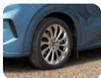
Alloy Wheel 19" 12-spoke design, Luster Nickel 7.5 x 19", offset 52.5, for tyres 235/50 R19.