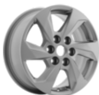
Alloy Wheel 16" 6-spoke design, Sparkle Silver 6.5 x 16", offset 50, for tyres 215/65 R16.