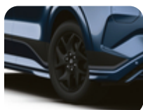
Alloy Wheel 17" 5-spoke design, Asphalt Matt Black 6.5 x 17", offset 50, for tyres 215/60 R17.