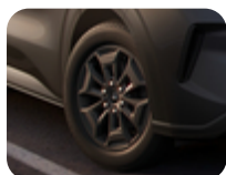
Alloy Wheel 17" 6-spoke design, Magnetic Matt 6.5 x 17", offset 50, for tyres 215/60 R17.