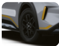
Alloy Wheel 16" 6-spoke design, Asphalt Matt Black 6.5 x 16", offset 50, for tyres 215/65 R16.