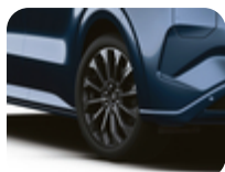
Alloy Wheel 19" 12-spoke design, Pearl Grey 7.5 x 19", offset 52.5, for tyres 235/50 R19.