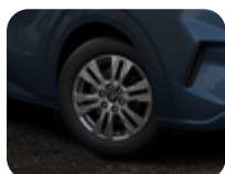
Alloy Wheel 17" 6-spoke design, Carbonized Grey 6.5 x 17", offset 50, for tyres 215/60 R17.