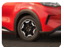
Alloy Wheel 17" 6-spoke design, Ebony Black 6.5 x 17", offset 50, for tyres 215/60 R17.