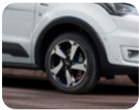
Alloy Wheel 17" 5-spoke design, black machined 6.5 x 17", offset 50, for tyres 215/55 R17