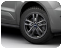
Alloy Wheel 16" 5 x 2-spoke design, Dark Sparkle 6.5 x 16", offset 50, for tyres 205/60 R16 and 215/55 R16