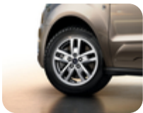
Alloy Wheel 16" 5 x 2-spoke design, Luster Nickel Single alloy wheel, 6.5j x 16", offset 50, fit with 205/60 R16 tyre or 215/55 R16