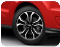
Alloy Wheel 17" 5 x 2-spoke design, black machined 6.5 x 17", offset 50, for tyres 215/55 R17