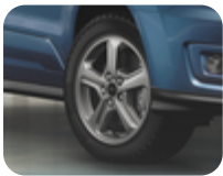
Alloy Wheel 16" 5-spoke design, Dark Stainless Single alloy wheel, 6.5j x 16", offset 50, fit with 205/60 R16 tyre or 215/55 R16