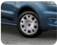
Wheel Cover 16" Single cover – Only in combination with steel wheel FINIS 2253395 and wheel nuts FINIS 1889420. Please ask your Ford Dealer for further information regarding the use of the correct wheel/wheel cover application