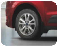
Alloy Wheel 16" 5 x 2-spoke design, Sparkle Silver Single alloy wheel, 6.5j x 16", offset 50, fit with 205/60 R16 tyre and 215/55 R16