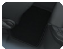
Velour Floor Mats rear, black Contoured, set of 2.