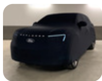
Premium Protective Cover black with white Ford oval and Explorer logo Tailor-made indoor full vehicle cover with white Ford oval, white Explorer logo and white day time running lamp logos on the front. Helps provide effective protection against dust and dirt when your vehicle is not in everyday use and maintains its sleek looks whilst it is stored in the garage.