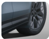
Mud Flaps front, contoured Set of 2.