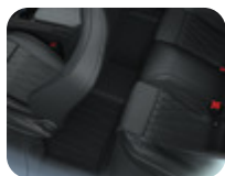
Rubber Floor Mats rear, black, tray style with raised edges Contoured, set of 2, raised edges help provide even better protection of the interior carpet against dirt and damp.