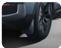
Mud Flaps rear, contoured Set of 2.