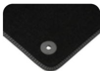
Velour Floor Mats front, black Contoured, set of 2, with fixings on the driver's side.