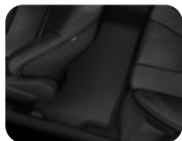
Velour Floor Mats front and rear, black Set of 4