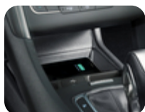
ACV Qi Wireless Charging Kit integrated vehicle-specific solution