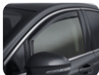
ClimAir®* Wind Deflectors for front door windows, black