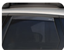
ClimAir®* Wind Deflectors for rear door windows, transparent