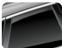
ClimAir®* Wind Deflectors for rear door windows, black

Note: Make sure that the wind deflector (in the mirror area) is seated on the window ledge (rail) and does not slip into the window slot