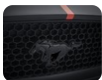
Black Pony Grille

Ford Performance Parts replacement front grille, black grill with black pony logo