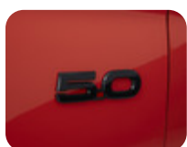
5.0 Badge left hand side, black

Self-adhesive badge for fitting on front wing – GT