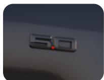
5.0 Badge right-hand side, black

Self-adhesive badge for fitting on front wing – GT