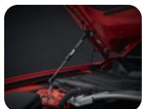
Hood Strut Kit with laser engraved Ford Performance logo

Lifts and keeps the hood (bonnet) open securely using 40.82 kg rated gas struts. Made from lightweight steel and aluminum with a durable black powder coated finish. Kit including two struts and installation brackets