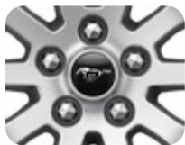
Center Cap with Mustang logo