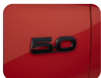
5.0 Badge left hand side, black

Self-adhesive badge for fitting on front wing – GT