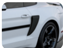
Body Side Scoop Kit matte black

Set of 2, body side scoops supplied with installation kit. Fixed with strong double-sided self adhesive tape.