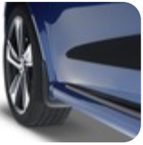
Mud Flaps front, contoured Set of 2 – ST-Line and ST-Line X