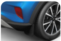
Mud Flaps rear, contoured Set of 2 – Titanium and Titanium X