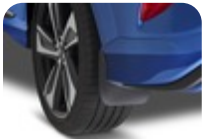
Mud Flaps rear, contoured Set of 2 – ST-Line and ST-Line X