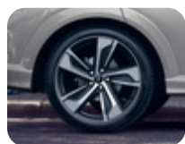
Alloy Wheel 19" 5-spoke design, Matt Black / Machined Single alloy wheel, 7.5 x 19", offset 47.5, 225/40 R19 93H tyre (not included) – Except ST and ST X