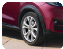
Alloy Wheel 18" 5 x 2-spoke design, Frozen White 7 x 18", offset 47.5, for tyres 215/50 R18 94H – Except ST