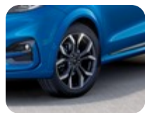
Alloy Wheel 18" 5 x 2-spoke design, Matt Black / Machined Single alloy wheel, 7 x 18", offset 47.5, 215/50 R18 92H tyre (not included) – Except ST