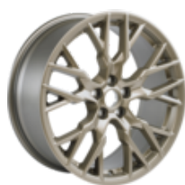
Alloy Wheel 19" 5 x 2-spoke Y design, Matt Pyrite Gold 8 x 19", offset 47.5, for tyre 225/40 R19 – ST