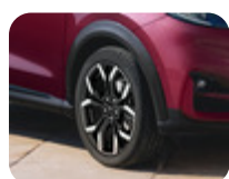
Alloy Wheel 18" 5 x 2-spoke Y design, Absolute Black 7 x 18", offset 47.5, for tyres 215/50 R18. – Except ST