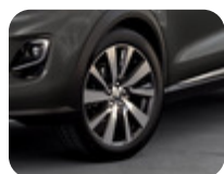
Alloy Wheel 18" 5 x 2-spoke design, Pearl Grey / Machined Single alloy wheel, 7 x 18", offset 47.5, 215/50 R18 92H tyre (not included) – Except ST