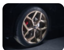
Alloy Wheel 19" 5 x 2-spoke design, Aurora Gold 8 x 19", offset 47.5, for tyres 225/40 R19. – ST