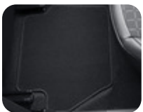
Carpet Floor Mats rear, black Contoured, set of 2