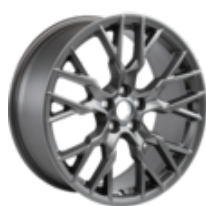
Alloy Wheel 19" 5 x 2-spoke Y design, Magnetite 8 x 19", offset 47.5, for tyres 225/40 R19. – ST