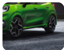
Alloy Wheel 19" 5-spoke Y design, Magnetite Machined 8.5 x 19", offset 47.5, for tyres 225/40 R19 93H – ST