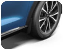
Mud Flaps front, contoured Set of 2 – Titanium and Titanium X