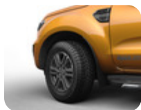
Alloy Wheel 18" 6 x 2-spoke design, Medium Bolder Grey 8 x 18", offset 55, for tyres 265/60 R18 – Except Raptor