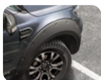
EGR* Wheel Arch Extension front and rear, matt black with chrome bolt caps