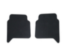
Velour Floor Mats rear, black Set of 2 – For double cab, XL, XLT and Limited series