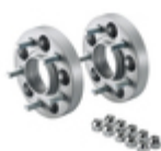
Eibach®* Pro-Spacer Kit wheel spacer "System 4", silver anodized

Set of 2 wheel spacers. Increases the vehicles track width offering improved stability. – To be used in combination with the Eibach® Pro-Kit suspension system