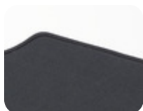
Velour Floor Mats rear, black Set of 2 – For Super cab, Limited series