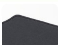
Velour Floor Mats rear, black Set of 2 – For Super cab, XL and XLT series