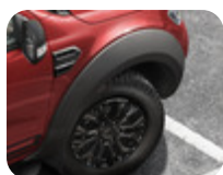
EGR* Wheel Arch Extension front and rear, matte black

Full 6-piece vehicle set. – Limited and Wildtrak, except vehicles with assisted parallel parking