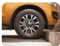
Alloy Wheel 18" 6-spoke Y design, Medium Bolder Grey 8.0 x 18", offset 55, for tyres 265/60 R18 – Except Raptor