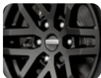
Center Cap – Raptor