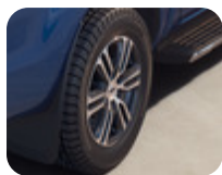
Alloy Wheel 18" 6 x 2-spoke design, Medium Bolder Grey Machined 8 x 18", offset 55, for tyres 265/60 R18 – Except Raptor