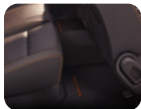
Velour Floor Mats rear, black Set of 2 – Double cab Wildtrak