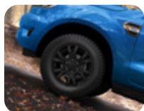
Alloy Wheel 18" 6 x 2-spoke design, Panther Black Single alloy wheel, 8j x 18", offset 55, 265/60 R18 tyre (not included)