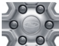
Center Cap silver