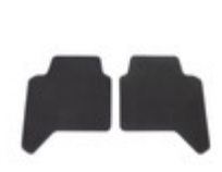
Velour Floor Mats rear, black Contoured, set of 2 – Raptor