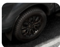
Alloy Wheel 18" 6 x 2-spoke Y design, black 8 x 18", offset 55, for tyres 265/60 R18 – Except Raptor