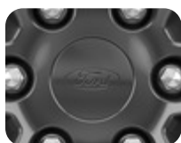
Center Cap Dark Grey