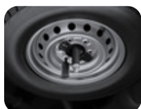
Spare Wheel Lock

Provides additional security for the spare wheel against theft – Raptor