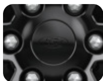
Center Cap Ebony Black