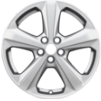
Alloy Wheel 18" 5-spoke design, sparkle silver Single alloy wheel, 7.5j x 18", offset 55, fit with 235/60 R18 tyre