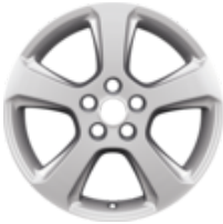
Alloy Wheel 17" 5-spoke design, sparkle silver Single alloy wheel, 7.5j x 17", offset 55, fit with 235/55 R17 tyre