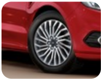
Alloy Wheel 17" 10 x 2-spoke design, Pearl Grey Single alloy wheel, 7.5j x 17", offset 55, fit with 235/55 R17 tyre