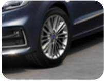
Alloy Wheel 18" 10 x 2-spoke design, dark stainless Single alloy wheel, 7.5j x 18", offset 55, 235/50 R18 tyre (not included)