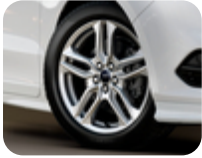
Alloy Wheel 18" 5 x 2-spoke design, sparkle silver Single alloy wheel, 7.5j x 18", offset 55, fit with 235/60 R18 tyre