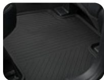
Rubber Floor Mats rear, black, for 2nd seat row Set of 2