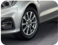
Alloy Wheel 17" 10-spoke design, sparkle silver Single alloy wheel, 7.5j x 17", offset 55, fit with 235/55 R17 tyre