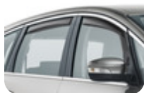
ClimAir®* Wind Deflectors for rear door windows, black

Note: Make sure that the wind deflector (in the mirror area) is seated on the window ledge (rail) and does not slip into the window slot