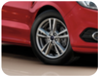
Alloy Wheel 17" 5 x 2-spoke design, sparkle silver Single alloy wheel, 7.5j x 17", offset 55, for tyres 235/55 R17