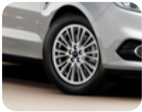
Alloy Wheel 17" 10-spoke V-design, sparkle silver Single alloy wheel, 7.5j x 17", offset 55, fit with 235/55 R17 tyres