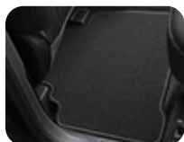
Velour Floor Mats rear, black, for 2nd seat row Set of 2