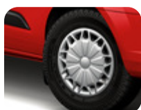
Wheel Cover 16"