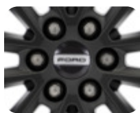
Center Cap black, with Ford lettering