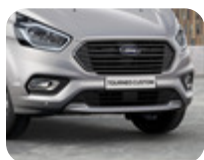
Front Spoiler kit, painted in silver