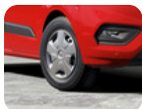
Wheel Cover 16"